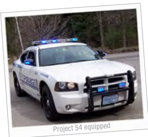
Project 54 equipped

Project54 is a fully integrated, voice operated, remote controlled police vehicle system developed by