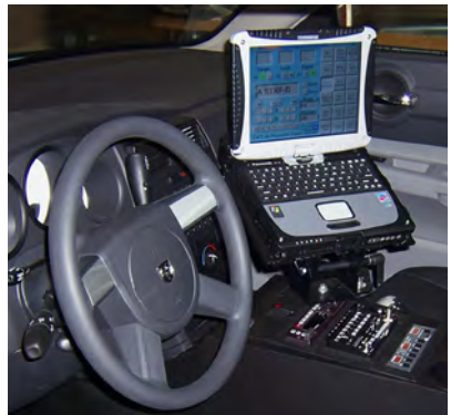
The Project54 system cleans up the cockpit and takes up no trunk space.